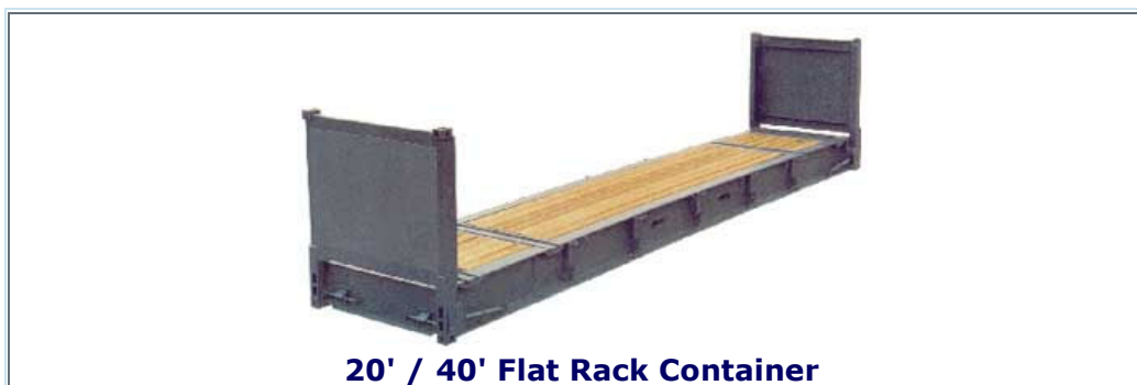
20' / 40' Flat Rack Container