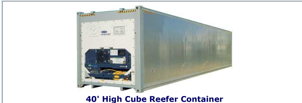
40' High Cube Reefer Container