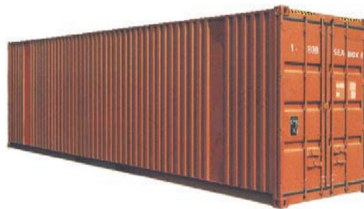
40' High Cube Container