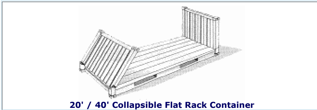
20' / 40' Collapsible Flat Rack Container