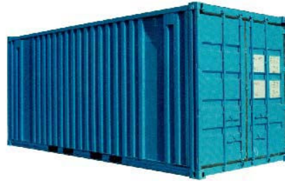
20' / 40' Conventional End Open Container

The following is a brief description of the various ocean freight containers.